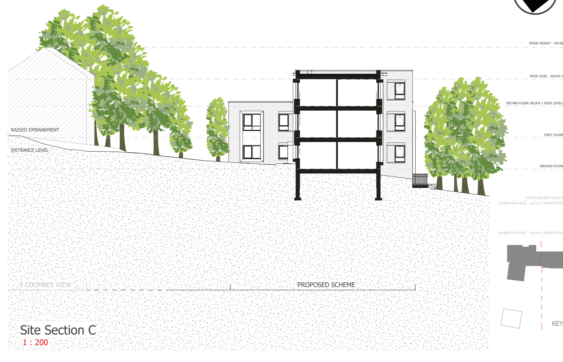
Site Section C 1 : 200